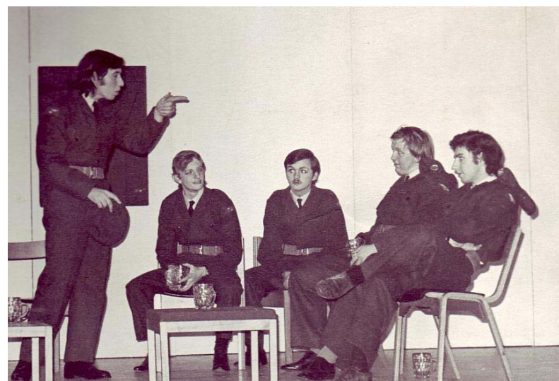
With an undergraduate drama group at Loughborough