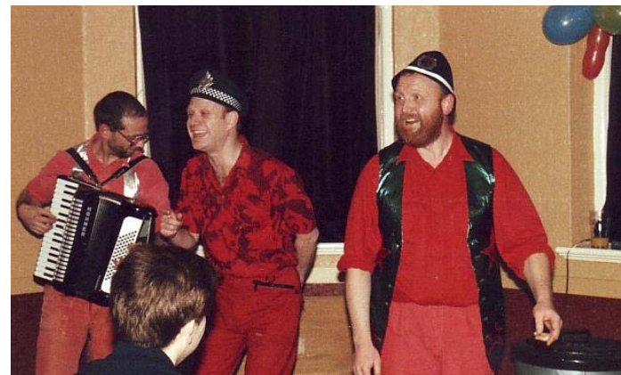
With Red Star Delivery— the policeman song

Above all he was a wonderful friend and companion: enthusiastic, intelligent, entertaining and loyal. This booklet has been put together by his family and friends as a tribute and a reminder of how he touched our lives.