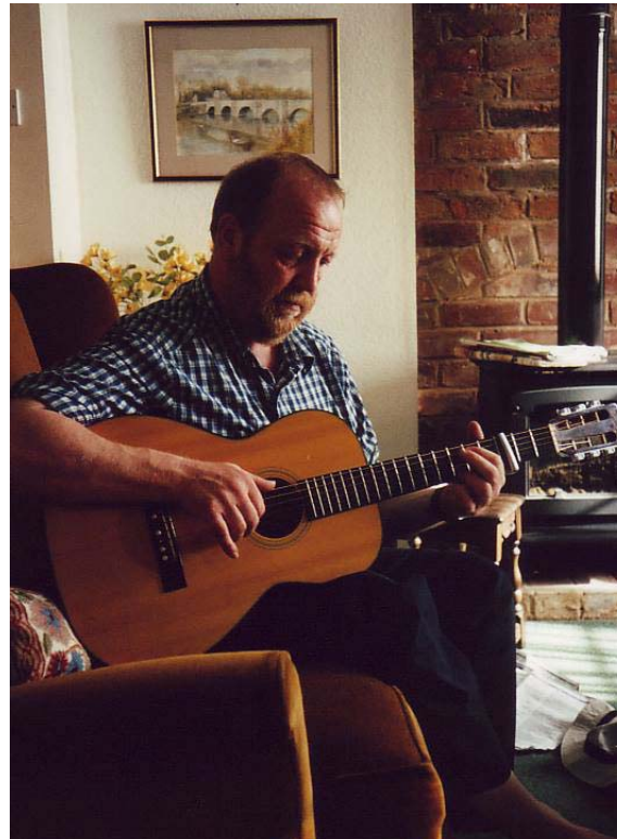
Practising at Sidmouth