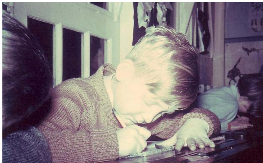
Concentrating hard at school, aged 8

When he left for University at the age of 18, his interest in the folk scene was firmly established and he brought home some awful records.